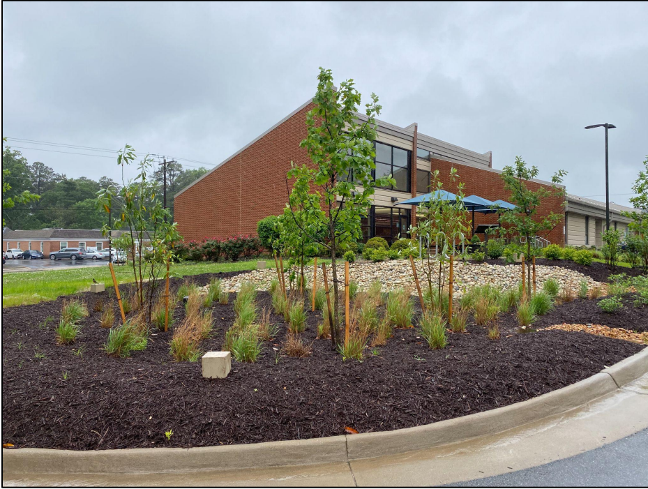
West End Branch