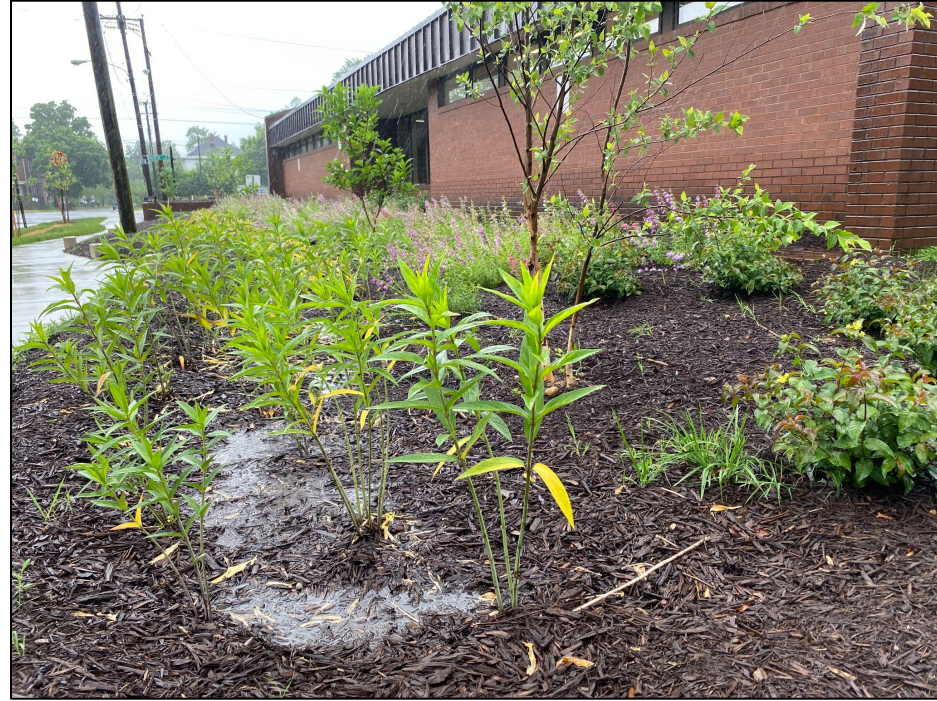
North Avenue Branch