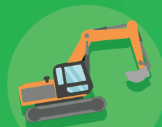
Habitat & water quality